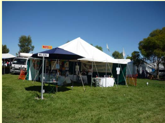
"The Limestone Coast Division of General Practice" Site.

As our major draw card over the two days, we performed basic health checks on anyone who was willing, taking blood pressure, BMI's and waist circumference. In total we completed 133 health checks which far exceeded the amount expected – especially being our first time. 63 of these were men and 46 women, with 24 people whose sex was not documented. Smoking cessation, sun protection and healthy lifestyle were also high on our promotional agenda. Our aim for this event was to focus on men's health however once we began health checks really did take over. We had keen interest during this event from many people of all ages and we are very excited to see what next years event brings. If anyone is interested to participate in next years event please contact me at the division on Tuesday and Wednesdays 8733 0160.